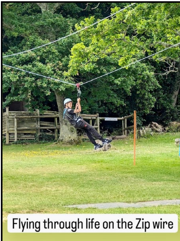
Flying through life on the Zip wire