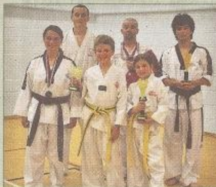
South Downs club members with the medal haul