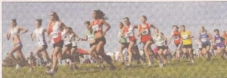
The women's and girls' race under way in the warm sun at Goodwood