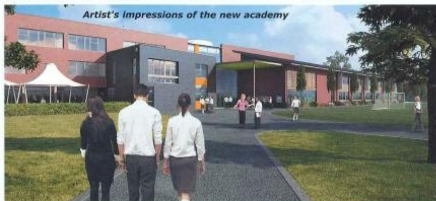
Artist's Impressions of the new academy

When the building is complete, Midhurst Rother College will be one of the best-designed and best-equipped schools in the country. However, importantly, the new facilities will not only serve students and staff, but will also provide an invaluable resource for the local community, particularly with a high standard of performing arts facilities.