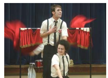
Splendid Productions -Dr Faustus

Drama students have also beentreated to a production of Dr Faustus by Christopher Marlowe, the text of which they are studying for exams. Written in the 16 th century and telling the tale of Faustus – a man who sells his soul to the devil – this could have been a difficult performance to watch but it was far from it. Visiting theatre company 'Splendid Productions' certainly did a splendid job in updating this classic text through comedy and audience participation. 'A' level students then took part in a workshop. The theatre company director complemented all of the students involved, saying she had 'never met such a quirky, individual and totally lovely group of students'.