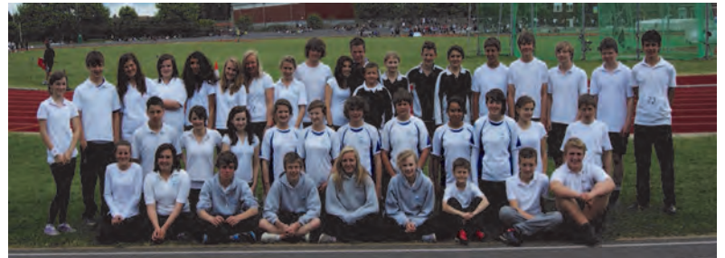
Midhurst Rother College Mountbatten Sports Team 2011

What's really exciting for me overall is that students are proactive and come to me with proposals of what they would like to get more involved in. A great example of this is our group of lady cheerleaders, Razzle Dazzle who not only put on performances for students and parents, but have also appeared at local garden parties and fetes. As a group they really take the lead themselves and I am so impressed by their energy, commitment and teamwork. Our cricket and stoolball seasons have now begun and already our athletics teams are in training for both outside fixtures and our own sports day.