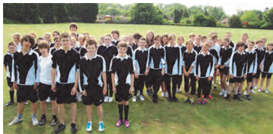
Year 8 Sports Leaders

and already we have a group keen to start training in September to take part next year. Although it's supposed to be for girls only, I'm pleased to say that some of our boys are keen to join the training too.