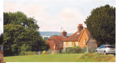
We can see the cranes from our Easebourne Site