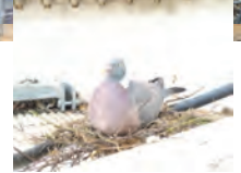
Someone has moved in already!

Our new build photo journey can be viewed on our website at www.mrc-academy.org